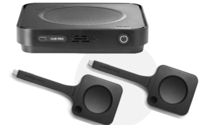
Hub Pro Dual display modular room system