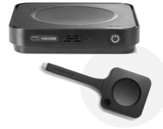
Hub Core Single display modular room system